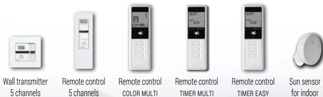
Wall transmitter 5 channels