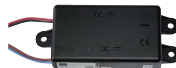
Deported receiver for lighting