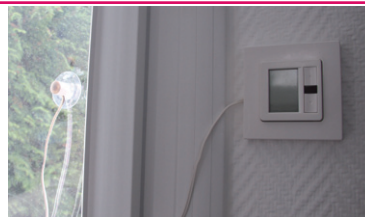
Sun / twilight sensor (cable of 1,50 m) Ref 2008800