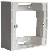
Surface mounting box : Ref 2210076