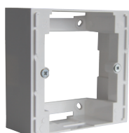
Surface mounting box: Ref 2210076